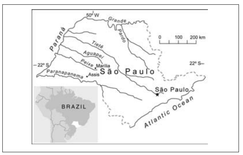
Figure 1. São Paulo state, showing places mentioned in text.

the farmers had lived in the area for their entire lives. In the archive, I first had to sift through approximately 350 boxes of material, noting the cases (mainly post-mortem property division, land subdivision, land-possession conflicts, and rural labor disputes) to which I would later return for a full reading. In this way, I tried to strike a creative tension between research in the archive and field sites.