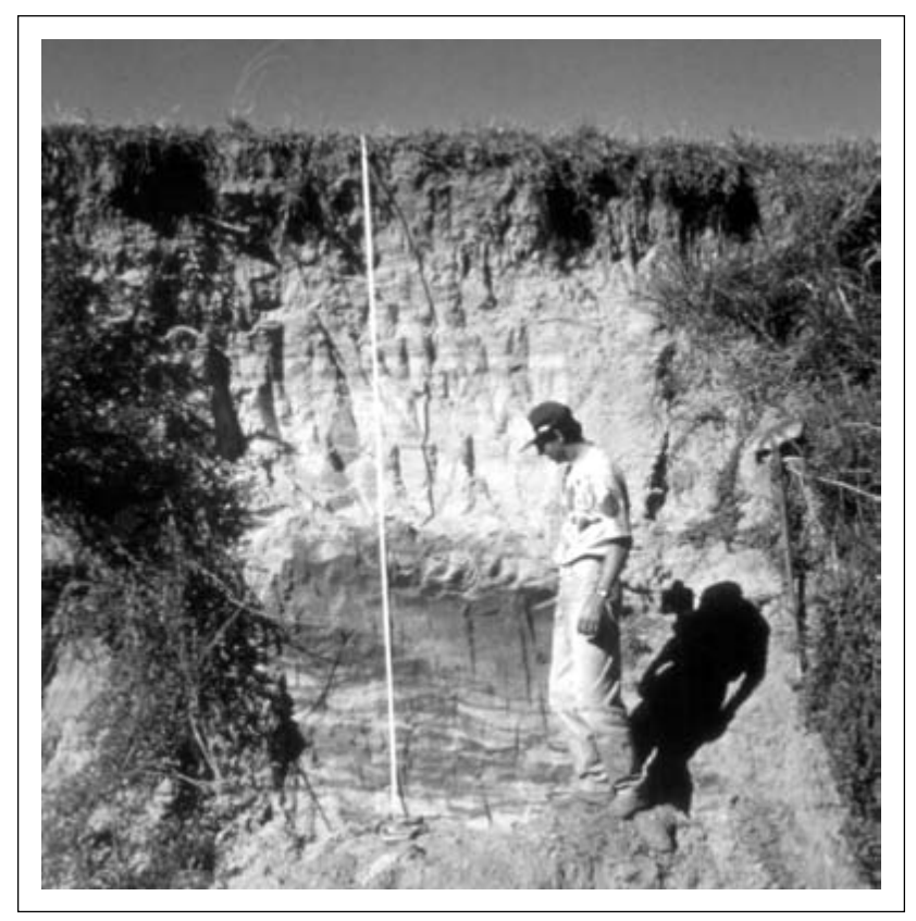
Figure 2. Recent sedimentation in the Barreirinho Creek, São Paulo state, Brazil. Site is approximately 40 kilometers north of Assis.

Results of radiocarbon dating of tree branches indicate twentieth-century origin of the post-settlement alluvium above the pre-settlement A horizon.<sup>30</sup>