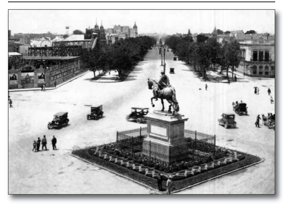
Figure 4. The Carlos IV statue, anchoring the beginning of the tree-lined Paseo de la Reforma, in the early twentieth century.

of Mexico at the end of the nineteenth century had not been fully reconciled and remained highly divisive despite massive efforts to synthesize a unified telling of national history.