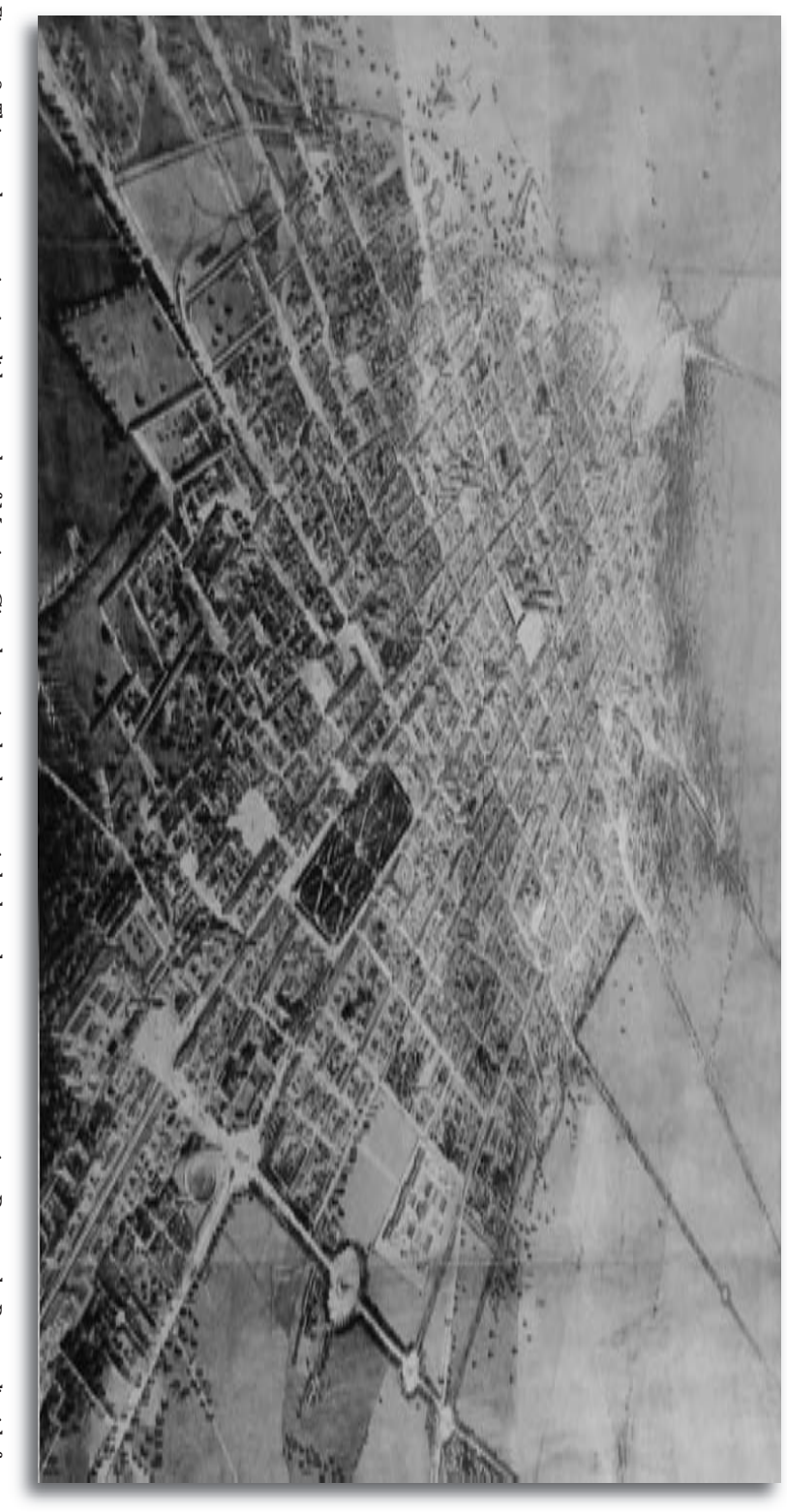
rotundas. The Rotunda connecting to the Alameda and Zócalo is the site of the statue of Carlos IV (Casimiro Castro, 1858). Figure 3. This southwest-viewing lithograph of Mexico City shows in the lower-right-hand corner an emerging Paseo de Bucareli with four