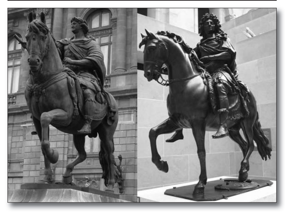
Figure 6. Tolsá's Carlos IV statue and Francois Girardon's Louis XIV statue.

The Mexican government was emphatic that the statue was being conserved as a piece of art. The largest type on the pedestal is the phrase declaring: "Mexico conserves this as a monument of art." The implications are that the historical memory is repugnant, yet the artistic value is sufficient to warrant the historical embarrassment of prominently displaying the former colonial monarch. In the newspaper articles about the monument and other sources, they frequently emphasize the ground-breaking production of the statue. The fact that it was the largest single casting in the world at the time was portrayed as a triumph of Mexican art. These portrayals characterize Mexico as a culturally sophisticated society that would place a high value on the arts, as if to say "Mexican nationalism is sophisticated enough to be above that."