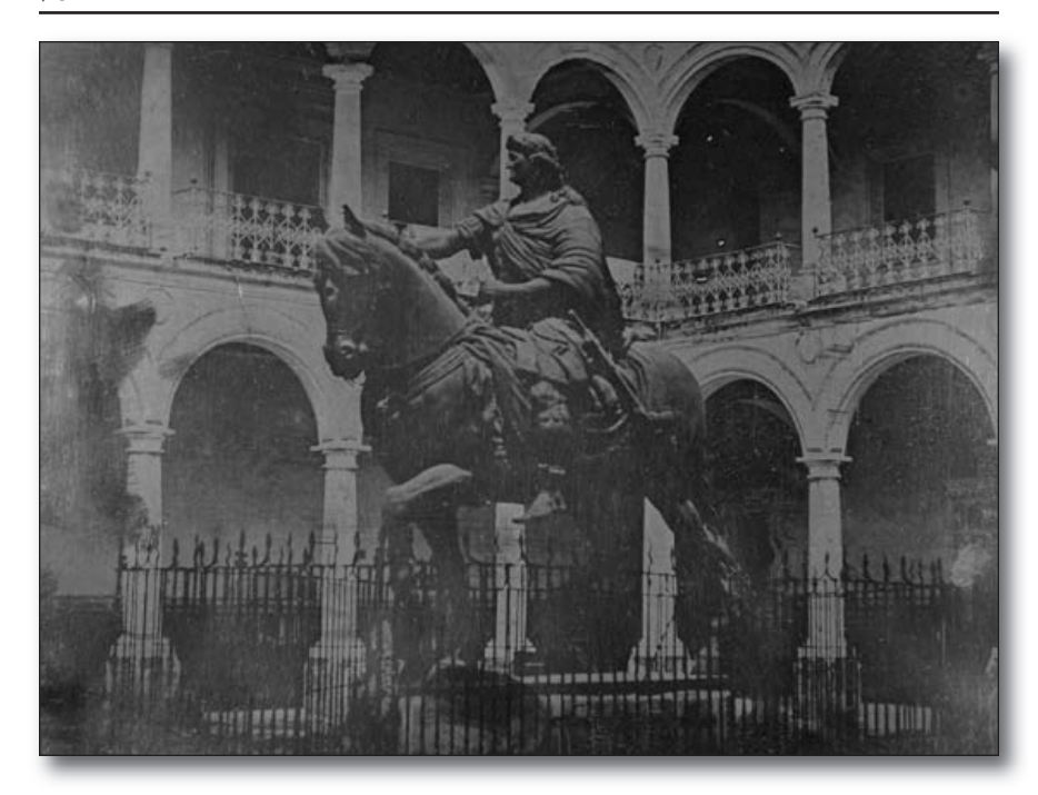
Figure 2. Statue of Carlos IV, hidden from the public eye, c. 1840.