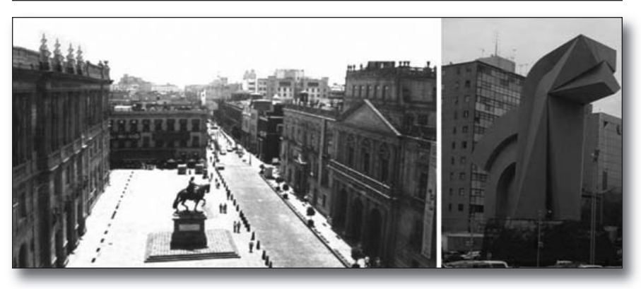
Figure 5. Today, El Caballito is in front of the National Museum of Art, facing the Palacio de Minería, with the alternate "Caballito" on Paseo de la Reforma.

exhibit. As it had been part of the urban fabric of Mexico City for over 100 years, the thinking of the planning commission was to keep it in a public, highly visible area (Figure 5). This shift completes the "Mexicanization" of a statue that portrays a Spanish monarch. By placing the statue in front of the National Museum of Art, the emphasis is on the sculptor and the artistic beauty of the work, not the history or the monarch being memorialized. The pedestrian plaza is now named Plaza Tolsá and the guided tours through that region point out the statue and emphasize that this is the masterpiece of Manuel Tolsá. Manuel Tolsá, the sculptor of El Caballito and the neoclassical artist who founded and was the director of sculpture and architecture at the Academy of San Carlos in Mexico City, became the principal reason for maintaining this statue as a representation of outstanding Mexican art. In this place, the statue is now sometimes referred to as El Caballito de Tolsá , further distancing the statue from the colonial message and strengthening the heritage of Mexican art.