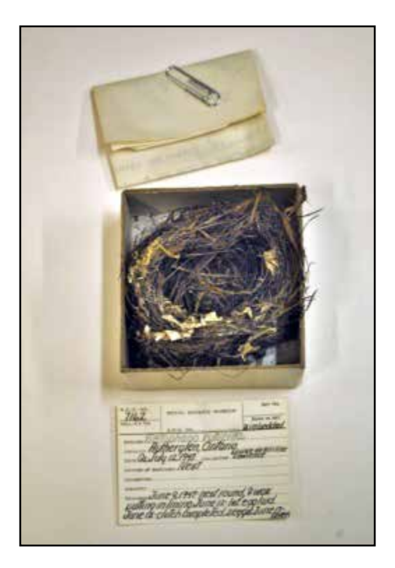
Figure 5: De Kiriline Lawrence nest specimen housed at the Royal Ontario Museum, Toronto, Ontario.

boreal forest. They are conifer seed specialists and often wander widely to locate good cone crops. The unique shape of their crossed bill allows them to pry the scale from the cone so they can remove the seed with their tongue. Their populations fluctuate with the cone crops.<sup>82</sup>