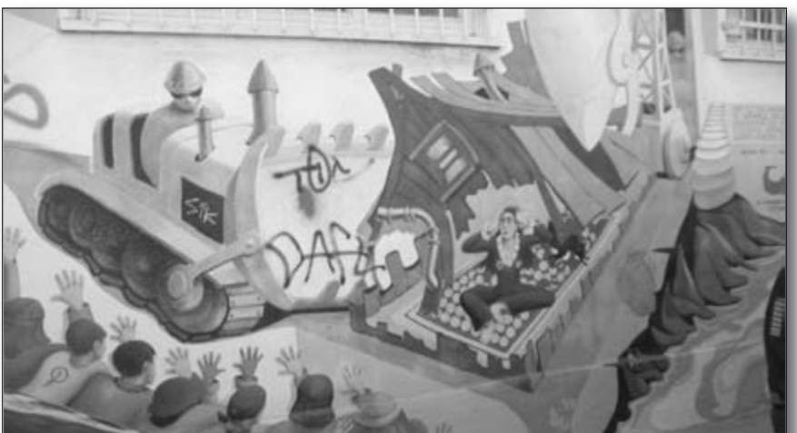
Figure 1. "The People of Venice versus the Developers" (the Venetian spray-painting the words "STOP THE PIG" not seen, left).

n a quiet side street in Venice, California, three blocks from the bustling Ocean Front Walk, a mural that few tourists are likely to see offers a bitter commentary on the historic-geographic dynamics of the landscape they have come to visit (Figure 1). This is the landscape of Los Angeles' "first" public park, the beach. Painted in 1975 (and re-furbished in 1997 by the community-based arts center SPARC (Social and Public Art Resource Center), the now graffiti-covered mural portrays a bulldozer and an excavator demolishing a simple, shore-adjacent cottage. As the house collapses a woman is revealed sitting cross-legged on the floor inside, making the viewer not only witness to a scene of violence but also an inadvertent peeping tom. The woman clutches her blue-scarfed head in fear and bewilderment while her cat leaps for safety. In the left foreground a group of Venetians protests the demolition, one by spray painting "Stop the PIG!" on a wall. "The People of Venice vs. the Developers" was painted when both property condemnations by the city and gentrification had begun to force out