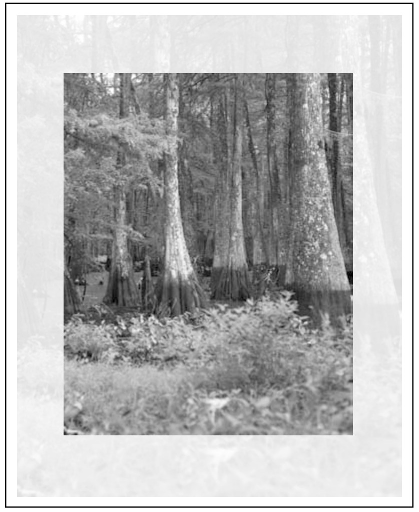
Bayou Cocodrie National Wildlife Refuge, Louisiana.