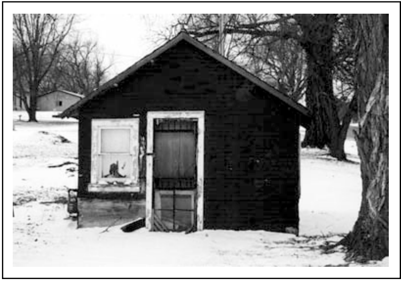
Figure 5. "Tiny red cottage with big tree," Rosalie, Nebraska. Photograph by Lana Miller.