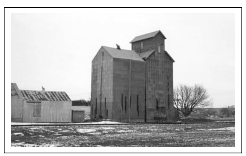
Figure 3. Rosalie Grain Elevator as a stopping point on the Chicago, Burlington, & Quincy Railroad line.

details their schools, churches, types of entertainment, and civic events. In 1917, Rosalie High School produced its first graduating class that consisted of five girls. The school's last class graduated in 1982 and contained five boys. The peak year of enrollment in the high school occurred in 1942, in which twenty-four students graduated.