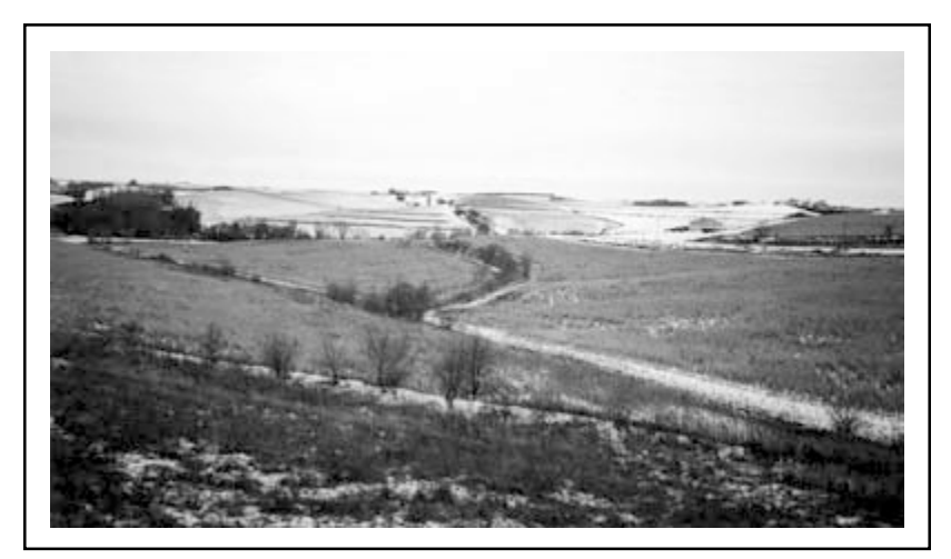
Figure 2. Omaha Reservation, traveling east to Macy, Nebraska, on Hwy. 94, looking south.

The Omaha Reservation sits picturesquely on the western shore of the Missouri River, overlooking the historic scene of the Lewis and Clark expedition. My recent travels there reminded me of how beautiful the Great Plains landscape is; the intimate relation of earth to sky, the browns of the earth against the white of the sky in winter, and the charm of austerity (Figure 2). Rolling hills, streams, and wooded areas of cottonwood, as well as various brushes and shrubs frame the scene. Farther west, low rolling hills hug the river and level off into agricultural land. Tribal land is mostly in row crops, but also in cattle grazing and forestry. As with much of the Plains, summers are hot and humid, marked by severe thunderstorms that bring most of the twenty-six inches of annual rainfall, and winters are severe. While an annual pow-wow brings visitors to Macy every August, the lack of any major transportation service on the reservation makes for few visitors.