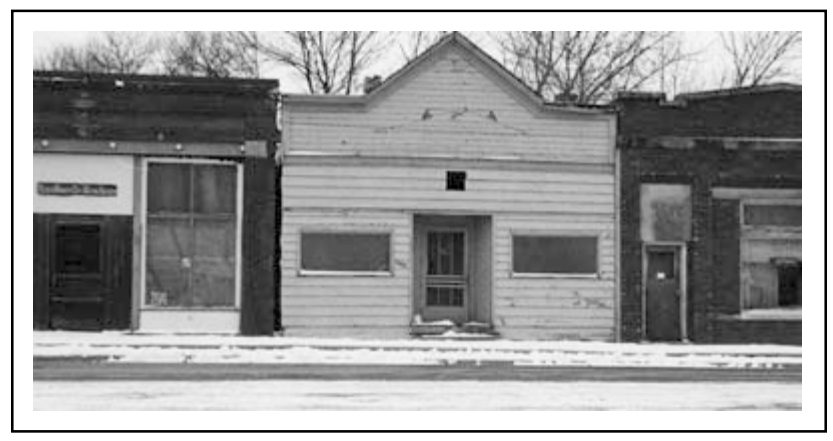
Figure 4. Rosalie's Central Business District today.

The story of Rosalie resonates with the much larger "obituary" of the rural Great Plains often relayed by journalists these days—collapsed home-