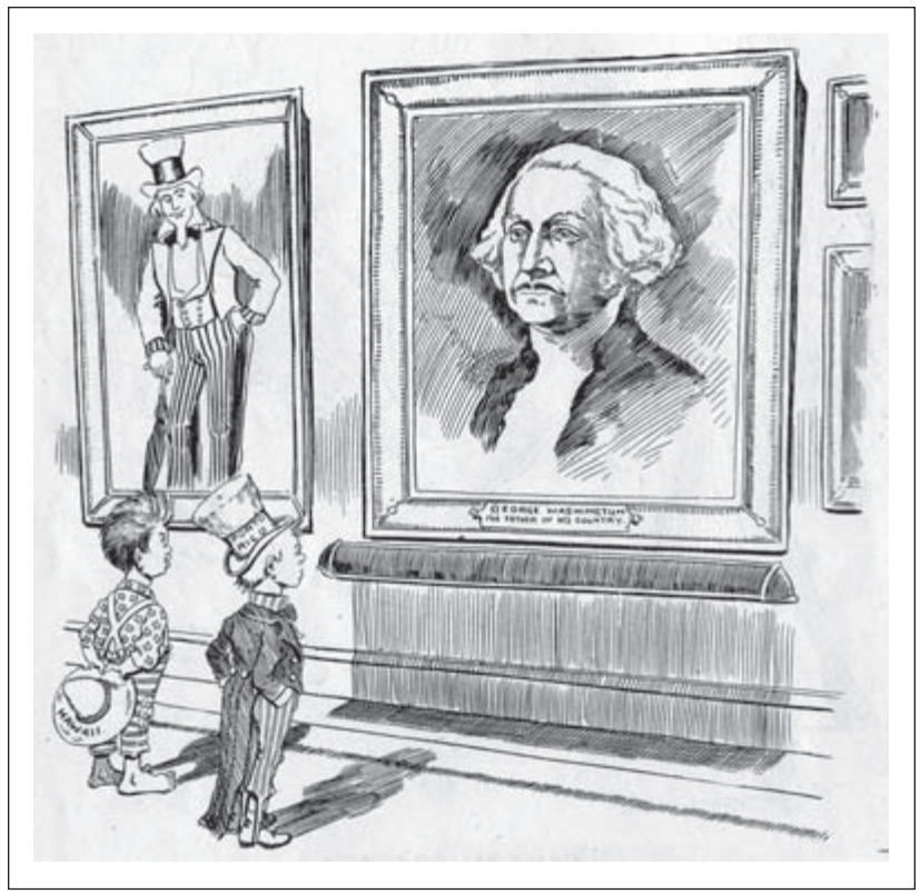
Figure 3. "Overheard in the National Art Gallery. Porto Rico – I Reckon He Must Be our Step Father – Eh, Hawaii?" (August 18, 1898).

By 30 July 1898, just after the first United States troops landed, we would see (in Figure 2) an Uncle Sam wearing a "World's Humane Agent" badge. In addition to this representation of America, there was also emerging a representational theme carried on throughout these cartoons. Namely, there is a discernable pattern of portraying a process of "civilizing" the youngsters, a process made evident by their taking on the trappings of the United States. Even more interesting than any change in their clothes, however, was the gradual change in their facial features and skin color (i.e., a process of whitening that came with colonization by the United States). There would also emerge a possible pattern of highly gendered domesticity, as rather rough boys would transform into domesticated girls amid further subjugation and education. Though still dark-skinned, Figure 2's Puerto Rico has facial features and hair much more like those of a "typical" Anglo American than Figure 1's far darker child.