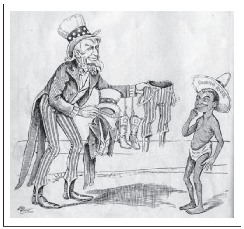
Figure 1. "Will Wear the Stars And Stripes. Uncle Sam – Here Sonny, Put on These Duds" (May 7, 1898).