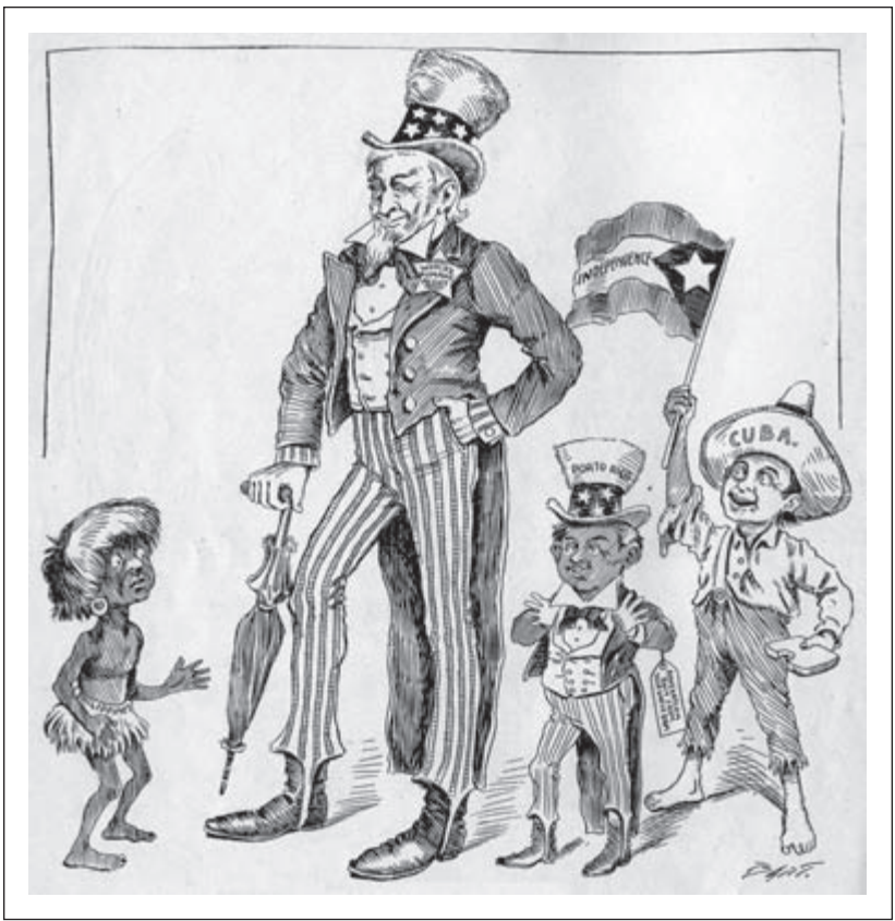
Figure 2. "Something Lacking. Uncle Sam – Well Sonny, What Is It? Phil Ippines – Where do I Come in on This?" (July 30, 1898).

simply reflective of his time, or were they conveying his own potential views on wider American sentiments that he also sought to critique? These factors of complexity in the cartoonist's possible intentions, in the representational themes and shifts that emerged over time within the large volume of his works, and in the presumed audiences that he attracted all contribute to make his works ones of particular interest.