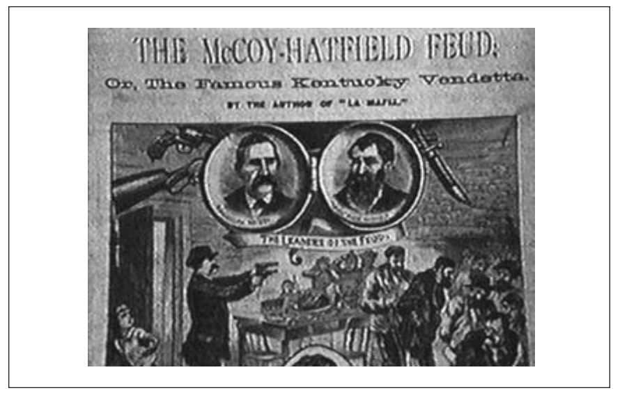
Figure 1. Cover of dime store novel about mountain feuds.

I begin my partial history with the first mass media representations of the region, travel writings and local color stories from the late 1800s. To a large extent, these defined the spatial signifiers, or signs, that have been used in subsequent representations. I then trace the use of three of these signs, the mountains, violence, and poverty, through the twentieth century in mass media images and academic explanations of the region's "otherness." This history of the still-dominant way Appalachia is known within America, however, is interrupted and complemented throughout by the representations of authors, filmmakers, and other individuals mostly identifying themselves as Appalachians—who contribute to the writing of Appalachia through their reference of, resistance to, and/or complicity with the marginalization of their space within this country.