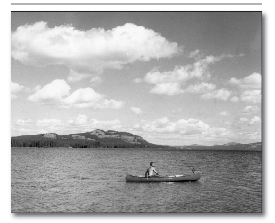
Figure 7. Southeast Arm of Yellowstone Lake, Yellowstone National Park. The lake is the largest lake at its elevation (mean lake level 7,733 feet above sea level) in North America, with 110 miles of shoreline and 135 square miles of surface area.

Lake, regaling in its splendors (Figure 7). With the passage of time, his opinion of the compromise had changed; his bitterness had softened. By 1974, he felt that the 5 mph compromise was an "85% victory on zoning and a compromise with which the park has been able to operate harmoniously." Certainly the compromise preserved some motorized access and protected most wildlife in the area, and the agency learned to live with it (in part because boater behavior improved). However, retrospection and the passage of time suggest that Garrison's assessment may no longer be accurate. 63