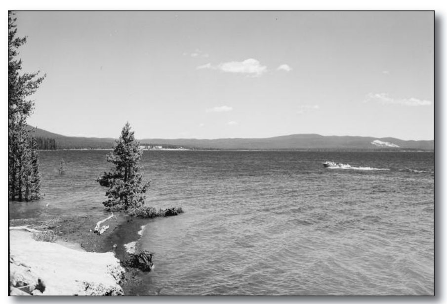
Figure 1. Speeding motorboat on Yellowstone Lake, circa 1960. Wakes from such boats, as well as other problem behaviors and rising motorboat numbers concerned Superintendent Garrison.

Riding his horse along the shores of Yellowstone Lake one summer day in 1958, Yellowstone's superintendent Lemuel Garrison had his mind full. Motorboat use on the lake had more than doubled in the past few years, in part because inexpensive fiberglass, aluminum, and plywood hulls were making boats more affordable to Americans. The rising number of boaters were associated with errant behaviors such as speeding, wildlife chasing, and creating waves that swamped canoes, all of which threatened the lake's resources and wilderness values (Figure 1). Human waste had become an additional offensive problem because boaters were not at the time required