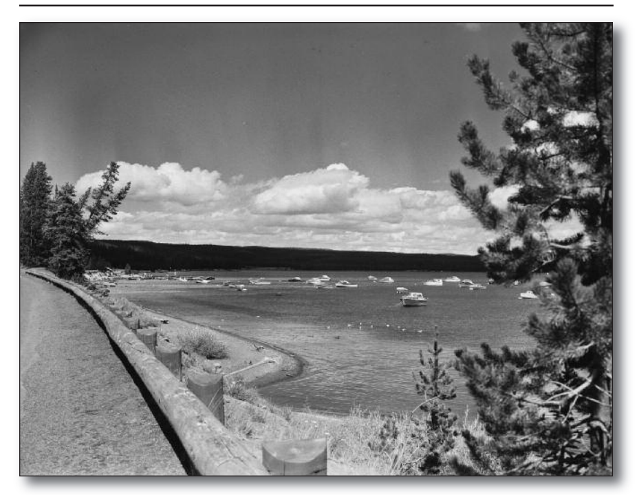
Figure 6. Motorboats on Yellowstone Lake, c. 1960. Garrison sought to balance non-motorized boating opportunities on Yellowstone Lake with improved motorized facilities, such as two more sheltered marinas to replace these exposed docking conditions.

ing proposal, including one that spring in The Living Wilderness , the magazine of The Wilderness Society. With the Wyoming Izaak Walton League and Montana Wilderness Association (a two-year-old Montana-based group dedicated to wilderness preservation) also on board,<sup>34</sup> Garrison and Wirth turned their attention to garnering more national support. Their challenge in that endeavor was that conservationists nationally had been preoccupied with passage of the Wilderness Bill for the last several years. Pleading directly for support from the leaders of most national conservation organizations, the two men argued that "the outcome of this issue will establish a precedent for years to come for the highest use of wilderness waters throughout the United States."<sup>35</sup>