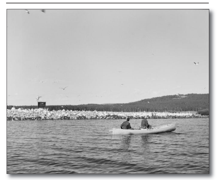
Figure 3. Canoeists observing nesting birds on the Molly Islands (circa 1960s). These two tiny islands at the south end of the Southeast Arm were (and still are) a crucial rookery for American pelicans, California gulls, and Double-crested cormorants.

creating or developing new national parks which promoted wilderness preservation and minimized road construction (such as Kings Canyon and North Cascades national parks). However, few administrators in older parks with established motorized usage (those developed when motorized use was seen as promoting nature preservation) applied those newer values in their parks by attempting to curtail or eliminate existing motorized uses. Garrison took that bold step, going to great lengths to restrict motorized boat access to Yellowstone Lake's arms over the next few years. In so doing, he became one of the earliest and most visible National Park Service (NPS) administrators to advance the newer conservationist values in established national parks. In Yellowstone, he effectively reinterpreted the NPS's mission to place preservation above recreation; to him, parks were wilderness cathedrals more than they were human playgrounds.