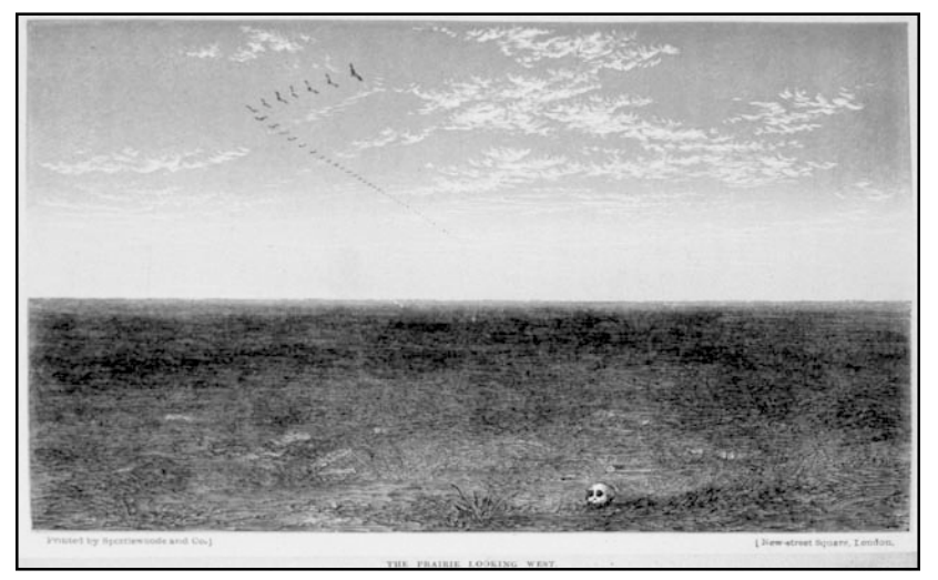
Figure 4. Humphrey Lloyd Hime, The Prairie, looking west , chromoxylograph printed by Spottiswoode and Co., and published in Henry Youle Hind, Narrative of the Canadian Red River Exploring Expedition of 1857 and of the Assiniboine and Saskatchewan Exploring Expedition of 1858 , 2 vols. (London: Longman, Green, Longman, and Roberts, 1860).

quently transformed into a color plate for Hind's Narrative (Figure 4). In it, a flock of birds, or more likely waterfowl, and wisps of high cloud were added to a clear blue twilight sky tinged with red. The addition of color and the presence of the flock infused the scene with life and suggested the availability of winged game for food; the change in compass direction directed the gaze to the promise of the lands stretching all the way to the Pacific; and the presence of a skull—which, by Victorian standards of morality, could only have been that of an Indian—and an animal bone symbolized the disappearance of the physical threats to westward territorial expansion. Tethered to Hind's argument, Hime's prairie portraits epitomized the expansionist dream: an empty (and therefore available), treeless (but no longer barren) land, free of Indian threat (to either land or life), and with potential for agricultural settlement and commercial development, expanded lines of communication and transportation, and increased national security.