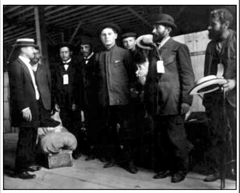
Figure 3. Rabbi Henry Cohen greets Galveston Movement migrants upon arrival at the Port of Galveston, 1907.