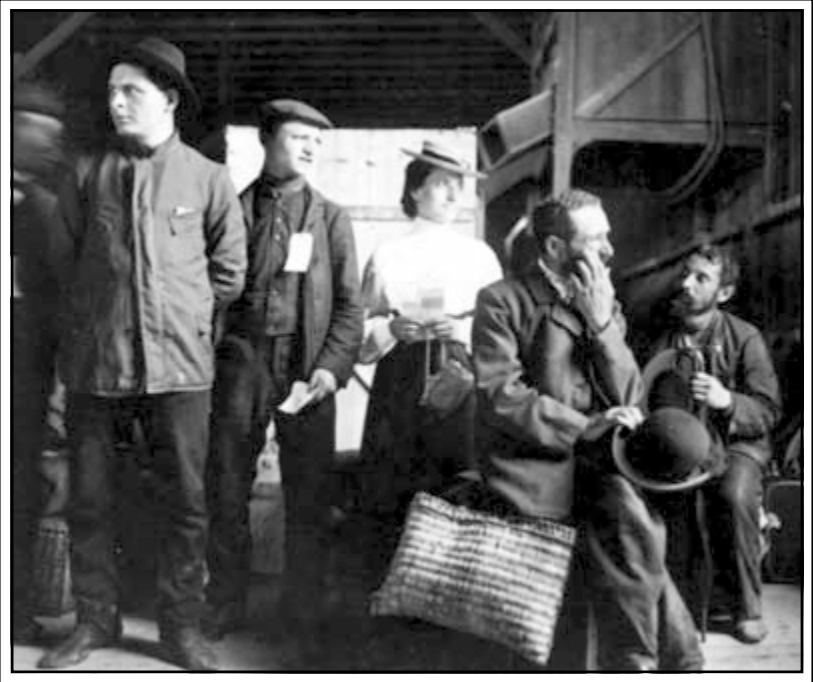
Figure 2. Galveston Movement migrants waiting for medical tests required for approved entry into the U.S., Port of Galveston, 1907.